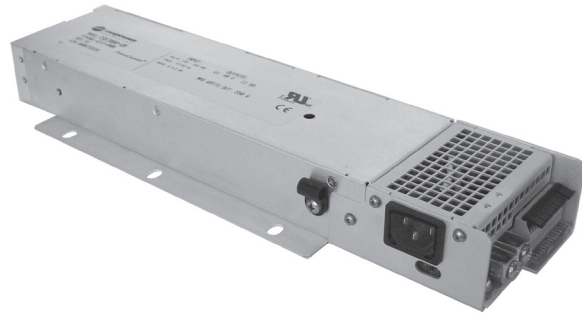
1.6"H x 4.6"W x 14.0"L (42 x 118 x 356 mm)

UL60950-1 CSA22.2, No. 60950-1 EN60950-1